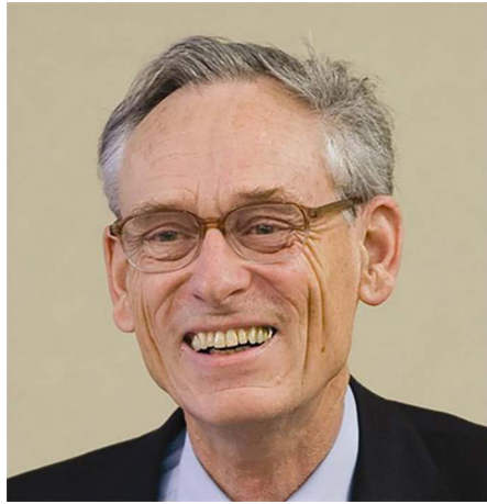
Figure 4. Photograph (from the 1990s?) used to accompany Elliott's biographical entry on the British Academy website. Elliott usually smiled when he spoke – a charming habit on which many have commented.

services to history. The year before he received the Premio Elio Antonio de Nebrija from the university of Salamanca; in 1996 Spain's Prince of Asturias Prize for the Social Sciences; and in 1999 Catalonia's Creu de Sant Jordi. That same year he also received the Balzan Prize for 'History, 1500–1800'. The terms of the Balzan Prize require recipients to invest part of the substantial cash award in a research project (see below). He used the rest to purchase a portrait of the count-duke of Olivares by the 17th-century Spanish master, Valdés Leal, to hang in his study.