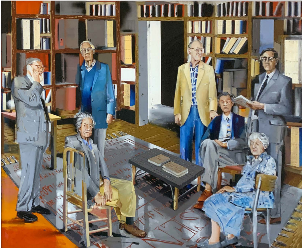
Figure 1. Stephen Farthing, 'Historians of Past and Present ' (NPG 6518). Elliott included a reproduction of this group portrait, done in 1999, in his autobiographical account, History in the making , with the following caption: '[It] depicts members of the editorial board of the journal in the 1960s, some more recognizable than others (left to right, standing: Eric John Hobsbawm, 1917–2012; Rodney Hilton, 1916–2002; Lawrence Stone, 1919–99; Sir Keith Thomas, b. 1933; seated: Christopher Hill, 1912–2003; Sir John Elliott, 1930–2022; Joan Thirsk, 1922–2013). The setting is imaginary but the doorway at the back may have been suggested by Velázquez's Las meninas , about which the artist and the author talked as the author sat for him.' By 1999 all seven members of the Board portrayed were Fellows of the British Academy.